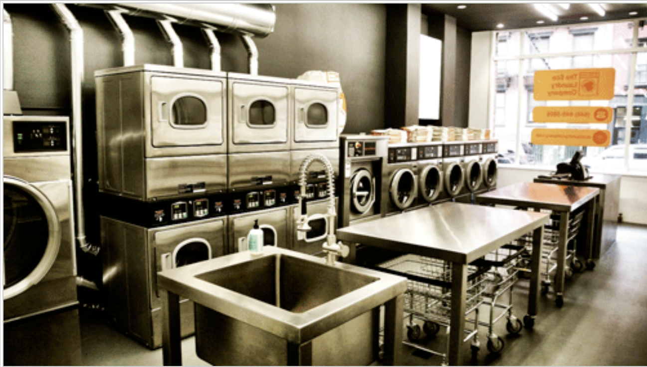
The Eco Laundry Company's low-temperature machines will reduce your own carbon footprint.